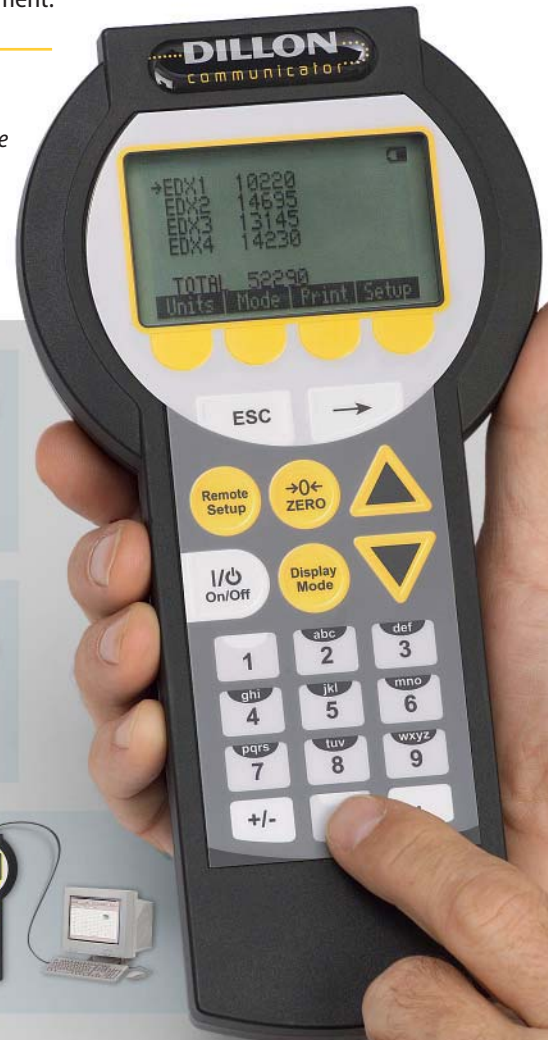
Optional Remote Communicator

A basic stand-alone model can be easily upgraded "in-the-field" to accommodate changing needs. Remote configuration, data acquisition and single point monitoring of multiple links are all possible with the hardwired or radio communication options available with the EDxtreme.